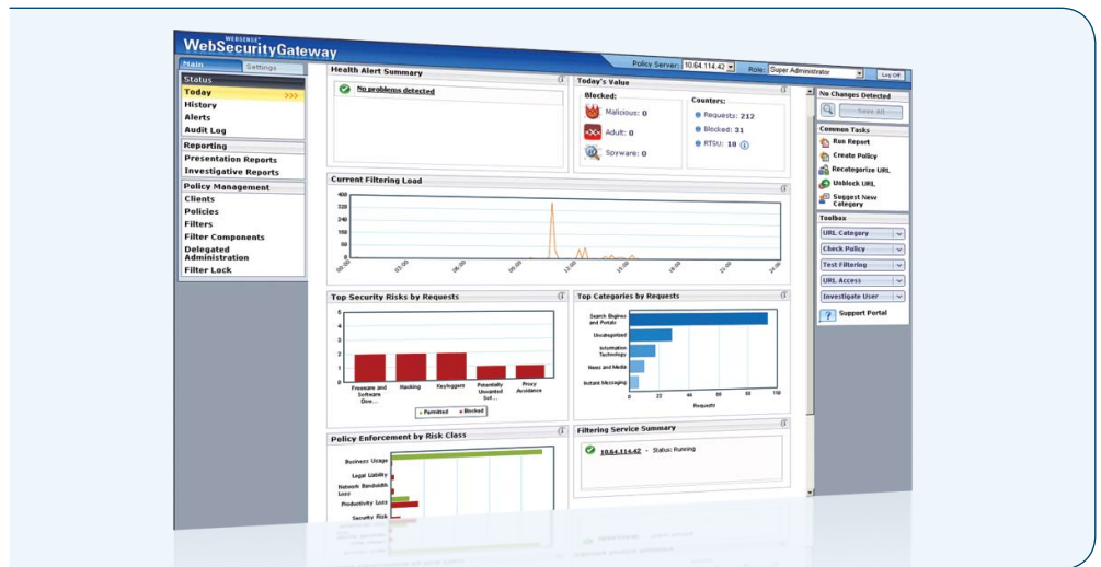
WebSense Management and Reporting

WebSense has embedded advanced analytics and real-time content inspection and classification technologies from the WebSense ThreatSeeker™ Network into the WebSense V10000. These embedded technologies offer protection from previously-uncategorized or unknown Web content “on the fly.” The WebSense V10000 is the only solution that categorizes specific content on Web pages such as mashups, rather than just the Web pages themselves, allowing IT managers to grant users to access Web 2.0 sites while their organizations are protected from sections of sites that are inappropriate or contain unwanted content. WebSense analyzes content posted to Web 2.0, social networking and blogger networks as it’s posted, using the industry’s first and only Web 2.0 early threat outbreak detection and protection system. This provides WebSense customers with protection from risks before they propagate.